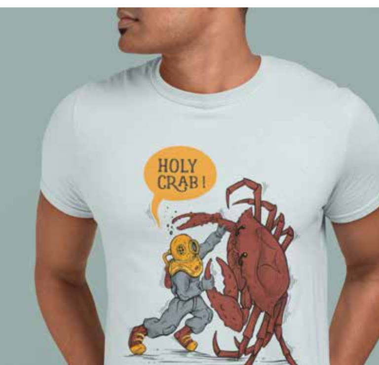
"The Crab Wrestler" T-shirt $20