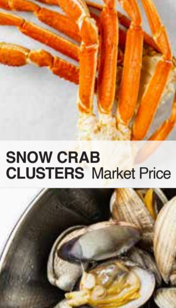
SNOW CRAB CLUSTERS Market Price