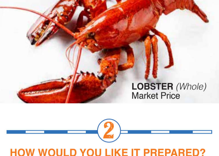
LOBSTER (Whole) Market Price