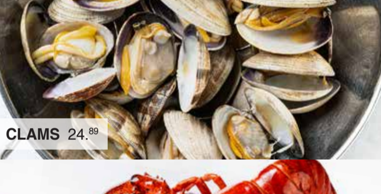
CLAMS 24. 89