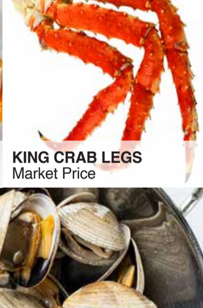
KING CRAB LEGS Market Price