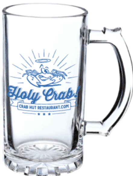
"Holy Crab" 16 oz. Beer Mug $8