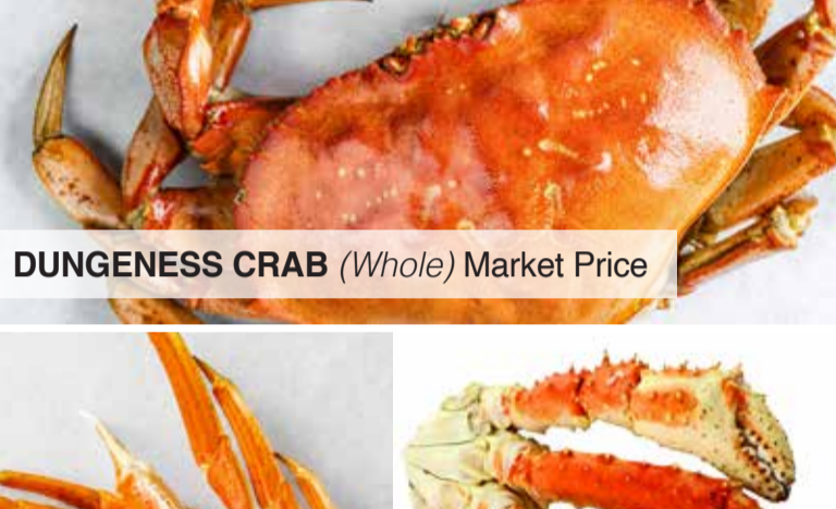
DUNGENESS CRAB (Whole) Market Price