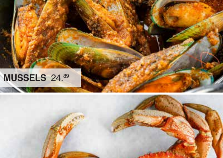
MUSSELS 24. 89