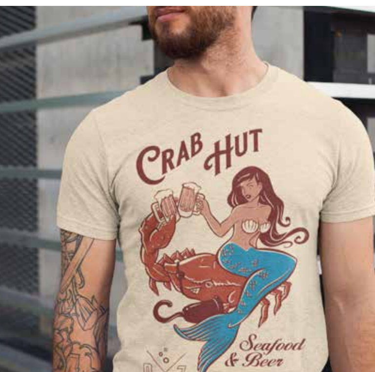
"Seafood & Beer" T-shirt $20